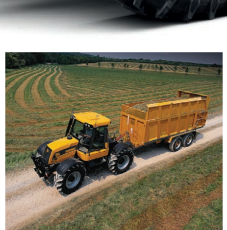
3155/3185 Fastrac - 1998