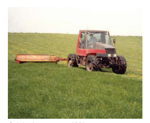
Original prototype 1991

With three ranges covering 160hp to 335hp (119kW to 250kW) there has never been a better choice of Fastrac – it's all the tractor you will ever need.